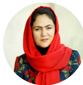
Fawzia Koofi Movement for Change in Afghanistan Leader