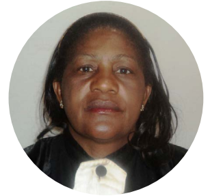
Thérèse Kulungu MBungu President of the World March of Women, Democratic Republic of Congo